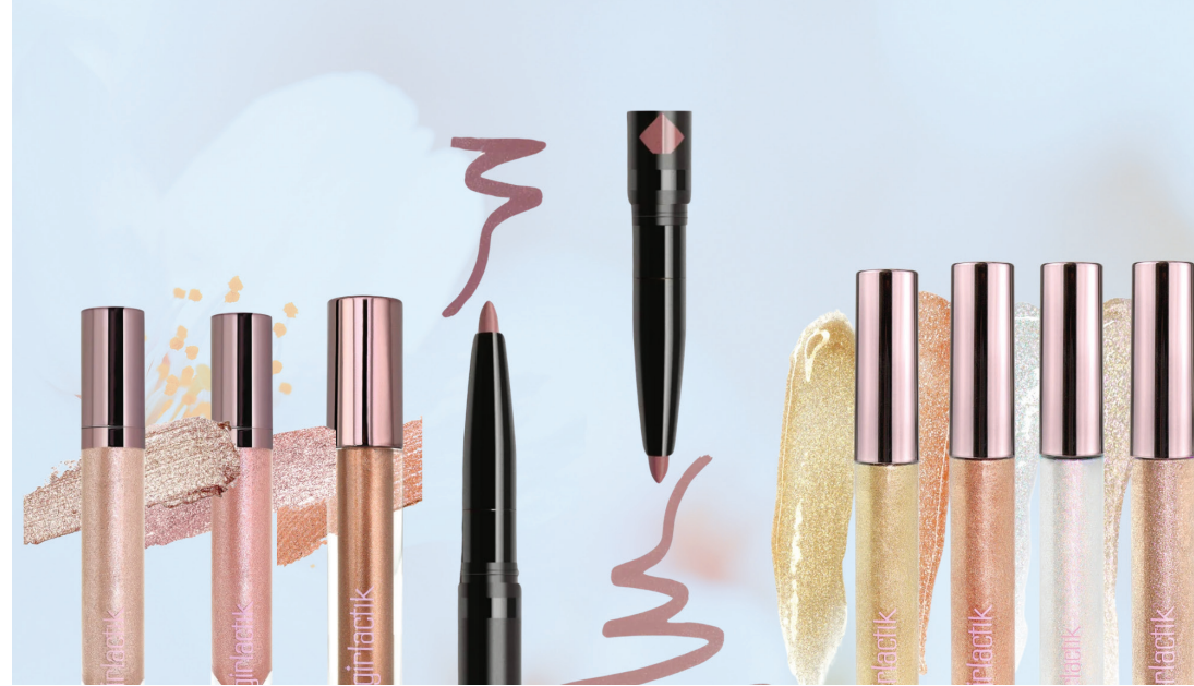
girilactik mirenesse girilactik

We all know how we never have enough time anymore. So we decided to condense our newsletter to serve you better, our beloved clients! Would you still like our picks for the month? Do not fret; use our Shopify account to see what products we love and save 10% on every order that you purchase online! Happy shopping!