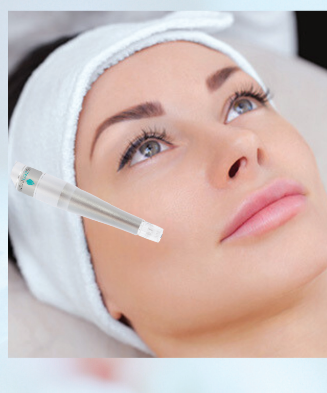
Rezenerate Growth Factor Facial