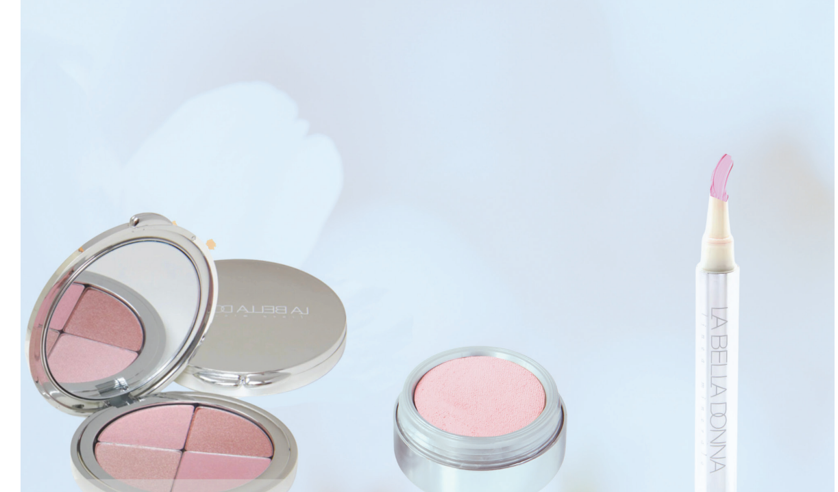
LA BELLA DONNA