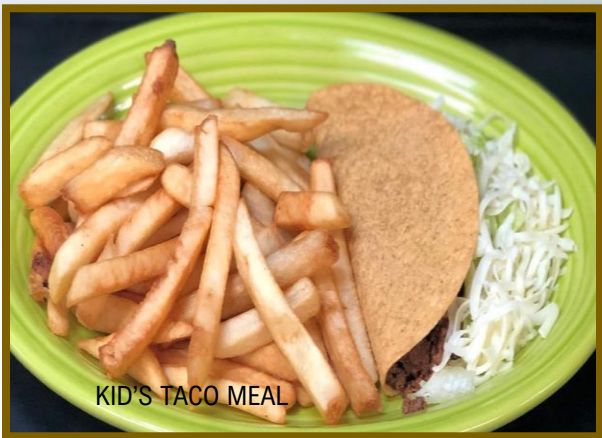
KID'S TACO MEAL